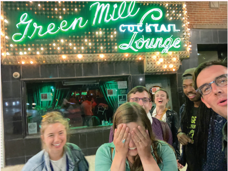
Rosé may have appeared at the celebration!

Not to slow down - Kelby hit the road for Brooklyn, Buffalo, Rochester, and Syracuse showing off our spring releases.