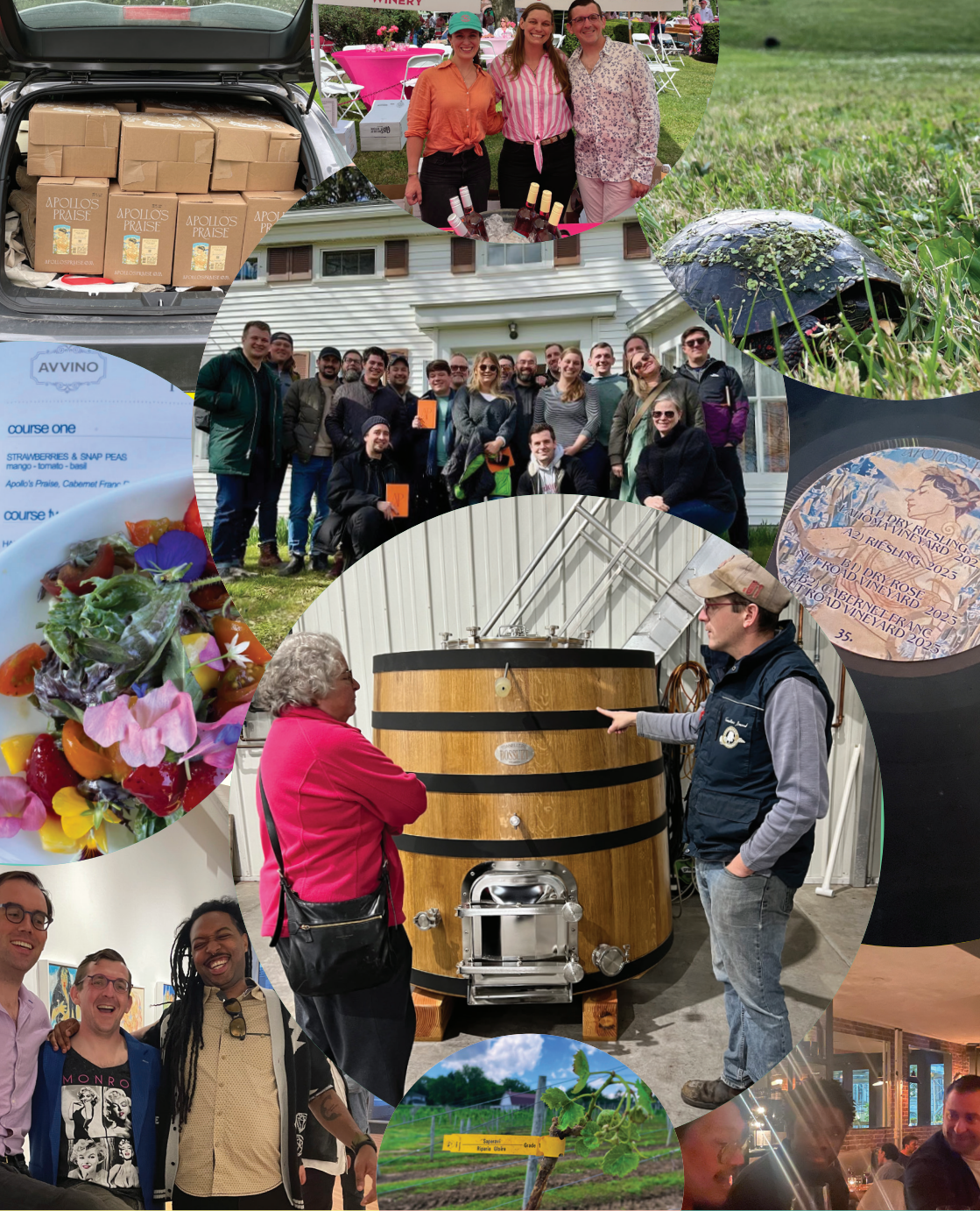
NYC, DMV, CHI, PHL, FLX - WE HAVE BEEN TRAVELING ALL OVER THE NORTHEAST THIS SPRING, BUT HOME IS WHERE THE HEART IS AND FOR US THAT IS THE FINGER LAKES <3